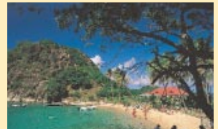
Les Saintes islands