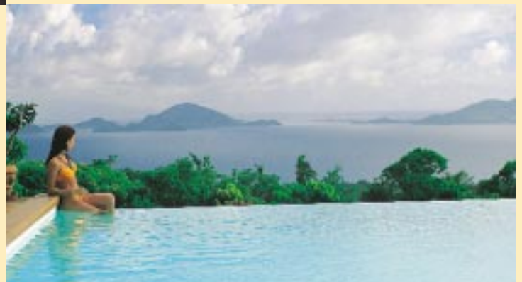
View of the Saintes islands from the pool.